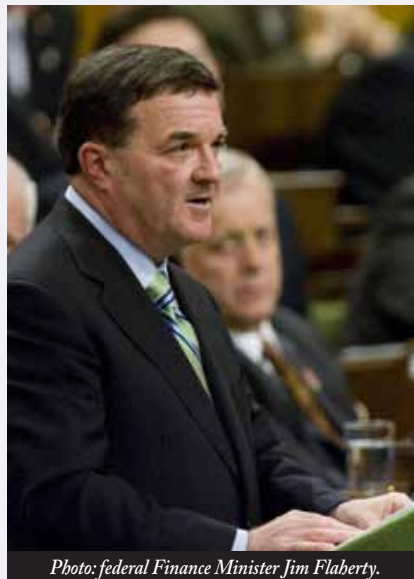
Photo: federal Finance Minister Jim Flaherty.